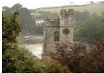
St Just in Roseland

St Mawes (14 Miles) - St Mawes is situated at the southern end of the Roseland Peninsula. An important port in medieval times, and now a characterful and chic coastal village and yacht haven, it is protected by the most perfectly preserved of Henry VIII's coastal fortresses. St. Mawes Castle was built in the 16th century to counter the invasion threat from Europe in partnership with its twin, Pendennis, on the other side of the Fal Estuary. There is a regular pedestrian ferry service to and from Falmouth, as well as a small seasonal passenger ferry with a regular service throughout the day between St Mawes and Place, offering an opportunity to explore the beautiful St Anthony Head and enjoy circular walks in the area.