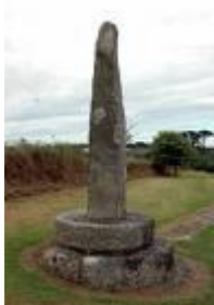
The Tristan Stone

The Hurlers, Minions - one of Cornwall's most important prehistoric sites, the Hurlers is a series of stone circles standing high on Bodmin Moor.