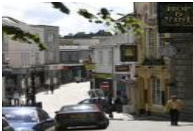
St Austell Town

St.Austell is home to the world famous Eden Project - www.edenproject.com To get there turn left out of the gate and left again at the crossroads on the main road. Upon reaching St Austell follow the brown signs.