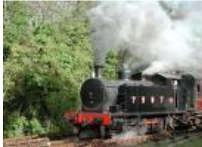
Bodmin Steam Railway