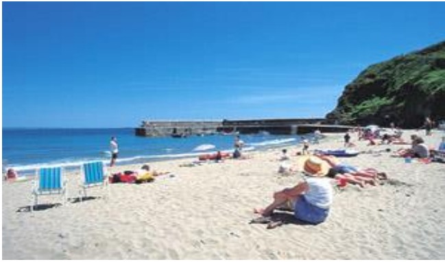
Gorran Haven Beach