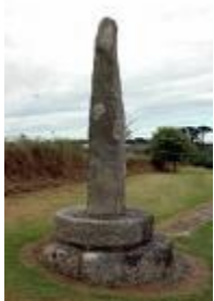
The Tristan Stone

The Hurlers, Minions - one of Cornwall's most important prehistoric sites, the Hurlers is a series of stone circles standing high on Bodmin Moor.