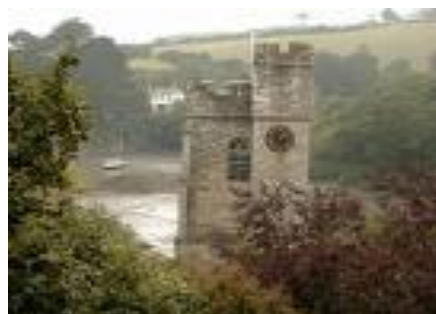
St Just in Roseland

St Mawes (14 Miles) - St Mawes is situated at the southern end of the Roseland Peninsula. An important port in medieval times, and now a characterful and chic coastal village and yacht haven, it is protected by the most perfectly preserved of Henry VIII's coastal fortresses. St. Mawes Castle was built in the 16th century to counter the invasion threat from Europe in partnership with its twin, Pendennis, on the other side of the Fal Estuary. There is a regular pedestrian ferry service to and from Falmouth, as well as a small seasonal passenger ferry with a regular service throughout the day between St Mawes and Place, offering an opportunity to explore the beautiful St Anthony Head and enjoy circular walks in the area.