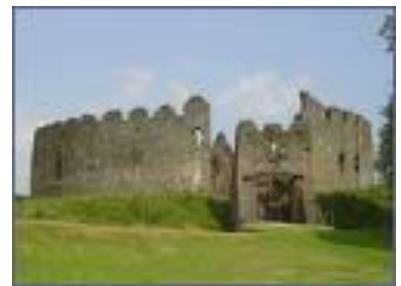
Restormel Castle – Lostwithiel

Fowey (18 miles) - Fowey (pronounced Foy) is situated on one side of the Fowey River estuary with Polruan on the other (which can be reached by passenger ferry). During high tides boat trips run from the town quay. Yachts and Dinghies crowd the estuary in the summer and from the docks, which lie upriver, China Clay is exported. There are two local festivals, the first is an arts and literature festival celebrating the life of its most famous resident Daphne Du Maurier, which runs during May www.dumaurier.org and the second is Fowey Regatta Week which is the village carnival week and takes place at the end of August – www.foweyregatta.co.uk Upon arrival it is recommended that you park in the main car park as it can get very congested in the town, although this does mean an uphill walk when you return to your car!