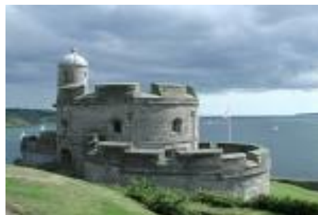
St Mawes Castle