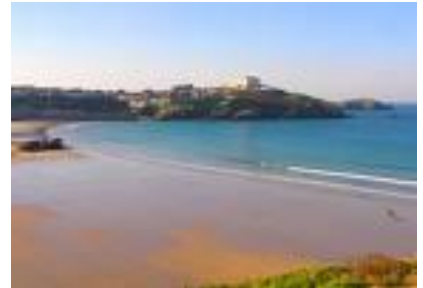
Watergate Bay – Newquay

Newquay (23 miles) - Newquay is situated on the north coast and is Cornwall's most popular resort offering large, sandy beaches and is the countries surfing capital. The town today has the reputation of being loud and commercialised due to its numerous amusement arcades, fun pubs, nightclubs and surf shops. Newquay has a Sealife Centre, Zoo, Fun Pools with flumes and boating lakes.