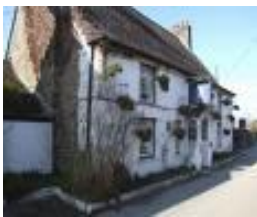
The Crown Inn, St Ewe

Pentewan (6 miles) - The village has a pub with beer garden, restaurant, tearoom, gift & general shop and water sports shop which also supplies diving air. The local Post Office is located in the Petrol Station. The village is dominated by the old harbour, built between 1818 and 1826, which has been silted up since the 1940's. The beach can be accessed across the harbour. To get there turn left out of the gate and left again at the crossroads on the main road. Turn right into the village immediately before the Texaco petrol station. There is limited parking.