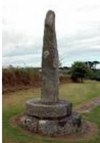
The Tristan Stone

The Hurlers, Minions - one of Cornwall's most important prehistoric sites, the Hurlers is a series of stone circles standing high on Bodmin Moor.