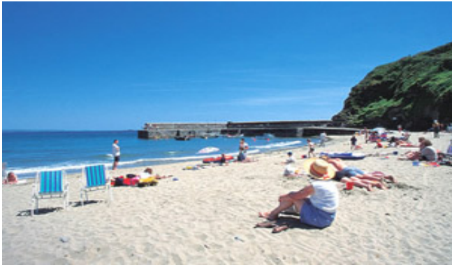
Gorran Haven Beach