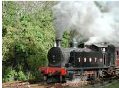
Bodmin Steam Railway