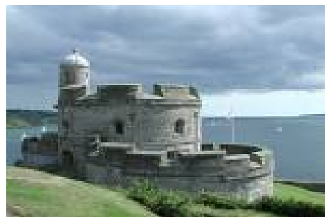
St Mawes Castle