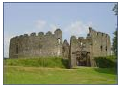
Restormel Castle – Lostwithiel

Fowey (18 miles) - Fowey (pronounced Foy) is situated on one side of the Fowey River estuary with Polruan on the other (which can be reached by passenger ferry). During high tides boat trips run from the town quay. Yachts and Dinghies crowd the estuary in the summer and from the docks, which lie upriver, China Clay is exported. There are two local festivals, the first is an arts and literature festival celebrating the life of it's most famous resident Daphne Du Maurier, which runs during May www.dumaurier.org and the second is Fowey Regatta Week which is the village carnival week and takes place at the end of August – www.foweyregatta.co.uk Upon arrival it is recommended that you park in the main car park as it can get very congested in the town, although this does mean an uphill walk when you return to your car!