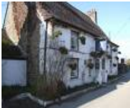
The Crown Inn, St Ewe

Pentewan (6 miles) - The village has a pub with beer garden, restaurant, tearoom, gift & general shop and water sports shop which also supplies diving air. The local Post Office is located in the Petrol Station. The village is dominated by the old harbour, built between 1818 and 1826, which has been silted up since the 1940's. The beach can be accessed across the harbour. To get there turn left out of the gate and left again at the crossroads on the main road. Turn right into the village immediately before the Texaco petrol station. There is limited parking.