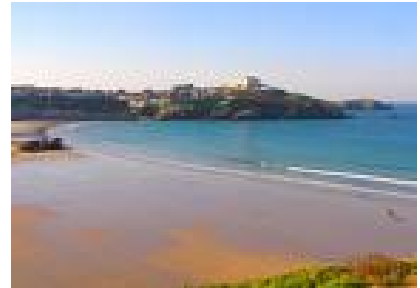
Watergate Bay – Newquay

Newquay (23 miles) - Newquay is situated on the north coast and is Cornwall's most popular resort offering large, sandy beaches and is the countries surfing capital. The town today has the reputation of being loud and commercialised due to its numerous amusement arcades, fun pubs, nightclubs and surf shops. Newquay has a Sealife Centre, Zoo, Fun Pools with flumes and boating lakes.