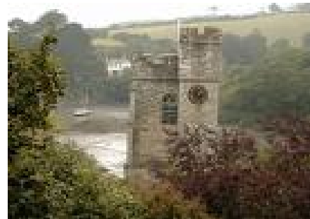
St Just in Roseland

St Mawes (14 Miles) - St Mawes is situated at the southern end of the Roseland Peninsula. An important port in medieval times, and now a characterful and chic coastal village and yacht haven, it is protected by the most perfectly preserved of Henry VIII's coastal fortresses. St. Mawes Castle was built in the 16th century to counter the invasion threat from Europe in partnership with its twin, Pendennis, on the other side of the Fal Estuary. There is a regular pedestrian ferry service to and from Falmouth, as well as a small seasonal passenger ferry with a regular service throughout the day between St Mawes and Place, offering an opportunity to explore the beautiful St Anthony Head and enjoy circular walks in the area.