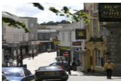
St Austell Town

St.Austell is home to the world famous Eden Project - www.edenproject.com To get there turn left out of the gate and left again at the crossroads on the main road. Upon reaching St Austell follow the brown signs.